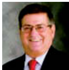
Kenneth M. Duberstein Chairman and CEO, The Duberstein Group, Inc.